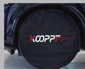
Car wheel cover